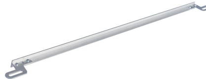
Picture: Guide rail for Topline PRO with double-angle